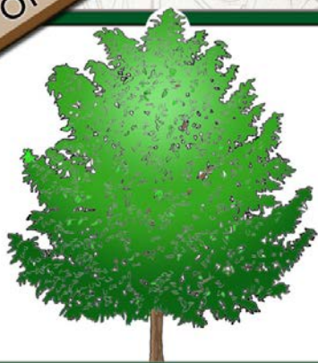
Paw Paw Tree

The paw paw tree grows to about 30 feet tall. The tree produces a soft, flavorful fruit.