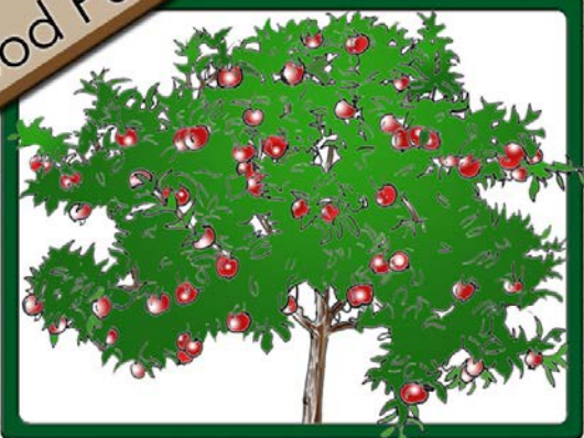
Dwarf Apple Tree

A dwarf apple tree grows to about 10 feet tall. It can produce a variety of tasty apples.